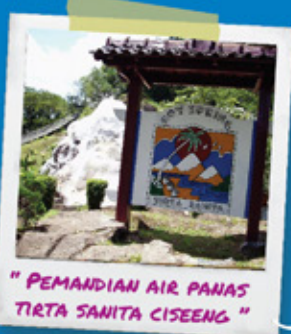
"PEMANDIAN AIR PANAS TIRTA SANITA CISEENG"

Hot water Tirta Sanita, Ciseeng is one of the unique tourist attraction, where a limestone hill located in the middle of the hot water out pesawahan with a high sulfur content. When viewed from a distance, chalk hill it will look like a snowy hill as the reflection of the white chalk dispersed by the flow of hot water that comes out in it