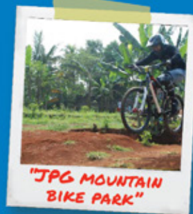
"JPG MOUNTAIN BIKE PARK"

JPG (Gas Pipeline) Mountain Bike Park, is one of the bikes spot in the BSD City, Serpong, every holiday the place is always filled with biker. They have a good track from beginner until an expert bikers..