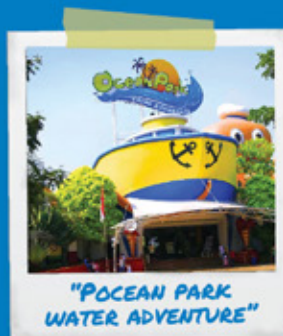
"POCEAN PARK WATER ADVENTURE"

Hot water Tirta Sanita, Ciseeng is one of the unique tourist attraction, where a limestone hill located in the middle of the hot water out pesawahan with a high sulfur content. When viewed from a distance, chalk hill it will look like a snowy hill as the reflection of the white chalk dispersed by the flow of hot water that comes out in it