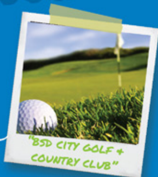
"BSD CITY GOLF + COUNTRY CLUB"

Pugung Raharjo is an archaeological site located approximately 50 km from the provincial capital, Bandar Lampung. The site boasts substantial megalithic and prehistoric remains dating from the 12th to 16th century AD. Pugung Raharjo was occupied from the 12th to 16th century. Based on research, the area was strongly under the influence of the Palembang-based Sriwijaya Empire. Finds of beads and Chinese porcelain indicate that the people of the area were also linked to international trade networks which visited the nearby Sunda Strait