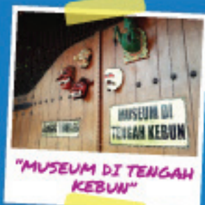
"MUSEUM DI TENGAH KEBUN"

Taman Mini Indonesia Indah (TMII) is a culture-based recreational area located in East Jakarta, Indonesia. The park is a synopsis of Indonesian culture, with virtually all aspects of daily life in Indonesia's provinces with the collections of Indonesian architecture, clothing, dances and traditions are all depicted impeccably.