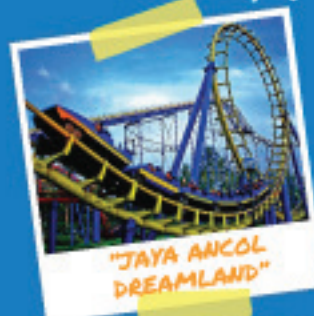
"JAYA ANCOL DREAMLAND"

Winner of Museum Awards 2013 as the best private museum in town is a 4,200sqm establishment at Kemang Timur Street. It offers 1,744 exhibits from 63 countries and 21 provinces in Indonesia, including valuable archeological artifacts from France, England, China, Japan and Mexico. Free admission fee and it is open only by appointment