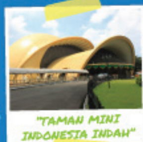
"TAMAN MINI INDONESIA INDAH"

Taman Mini Indonesia Indah (TMII) is a culture-based recreational area located in East Jakarta, Indonesia. The park is a synopsis of Indonesian culture, with virtually all aspects of daily life in Indonesia's provinces with the collections of Indonesian architecture, clothing, dances and traditions are all depicted impeccably.