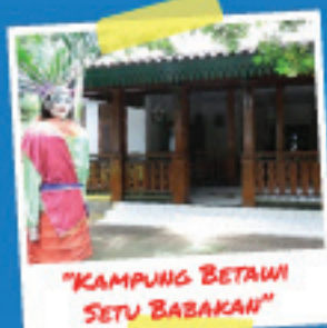
"KAMPUNG BETAWI SETU BABAKAN"

Inhabited by more than 260 kinds of animals, including scarce and almost extinct animals from Indonesia and also other parts of the world; the zoo is home for 3,000 species. Located within the zoo is the Primate Center, privately funded and still is one of the largest such centers in the world with special focus for housing various primates including gorillas, chimpanzees and orangutans