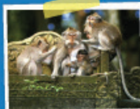
"UBUD MONKEY FOREST"

If seen from above, it resembles the island of Bali in rock formation. It often deems as a popular tourist icon and cultural icon. Many photographers also think that the place is very exotic for its natural beauty