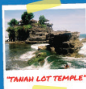
"TANAH LOT TEMPLE"

If seen from above, it resembles the island of Bali in rock formation. It often deems as a popular tourist icon and cultural icon. Many photographers also think that the place is very exotic for its natural beauty