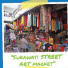
"SUKAWATI STREET ART MARKET"

Located at Gajah Mada Street, it is Bali's most distinguished and long-standing art market. Visitors often come here to seek for Balinese art items like paintings and sculpted wooden figures, handicrafts and traditional handmade products