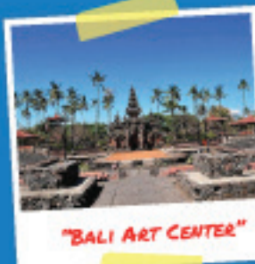
"BALI ART CENTER"

Favored for its great waves that is ideal for surfing adventures, the beach never failed to attract plenty of international surfers coming all the way from distanced places. It also features picturesque panorama of the Indian Ocean, the wide white sand and numerous international restaurants for after surfing